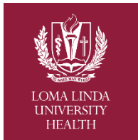
Pamela Figueroa Radiation Oncology Ext. 87458