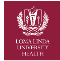
Tatiana Flowers Surgery Ext. 44289