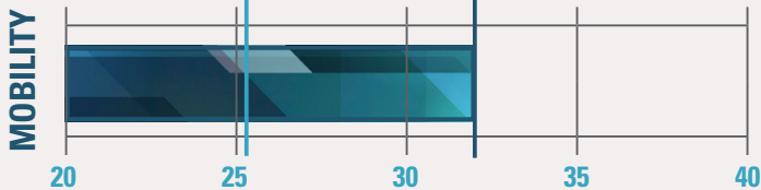
LLU Medical Center Inpatient Acute Rehabilitation