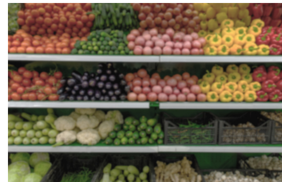
Vision after Cataract Surgery